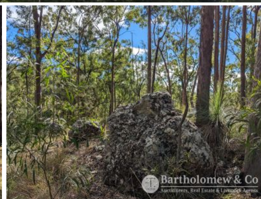
Wilson Road Clumber, QLD